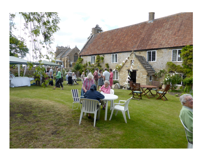
Church Plant Sale, Flower Festival & Teas